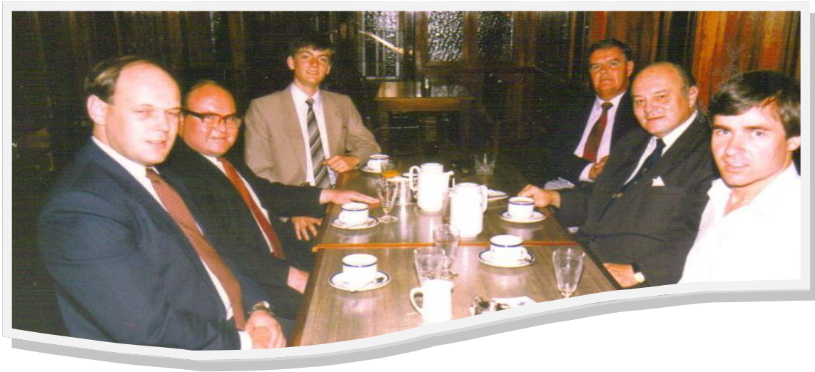
An early committee meeting