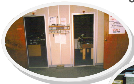
Studios 1 and 2