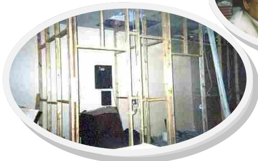
Our new studios