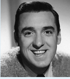
JIM NABORS PAGE 5